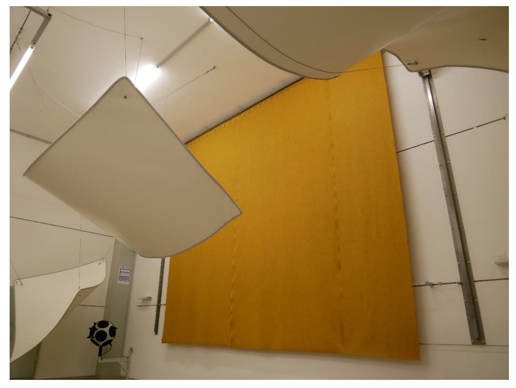
Figure B.2. Test object mounted in the reverberation room (diagonal view).